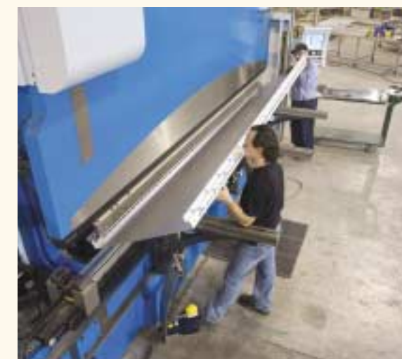
The Finn-Power H press at LC Bakery Equipment Services Ltd., is equipped with CNC crowning, bed referencing Y1 and Y2 encoders and an Easy Bend angle measurement system for accurate bending along the entire length of the brake.

Easy Bend is a mechanical angle measurement system to guarantee the accuracy of the angle during the bending cycle. It compensates for variations found in the material (both thickness and tensile) and is fully programmable. You can program its use for all bends or only some of the bends in a program. Its measurements can be shared from one bend to another. Its position along the bed is programmable for each bend. And it is fast, only adding approximately three seconds to a bend cycle.