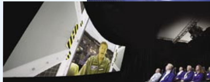
The marketing hit of FABTECH was Finn-Power's reality-ride theater that featured the Shear Genius Flexible Manufacturing Cell. On the big screen is actor Gary Kroeger, an alumnus of NBC's Saturday Night Live . Finn-Power www.rsleads.com/601tp-178