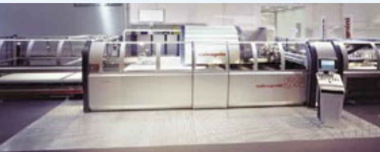
The 2006 Salvagnini S4N punching and shearing machine dramatically reduces the distance of sheet travel required to punch parts. Salvagnini, www.rsleads.com/601tp-174