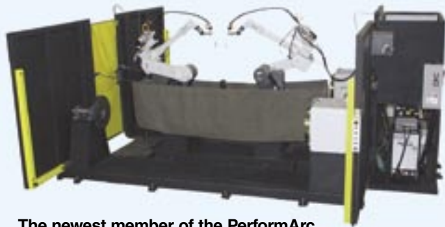
The newest member of the PerformArc family of arc welding robotic works cells is the 212S. Panasonic Factory Solutions, www.rsleads.com/601tp-177