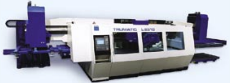
New, optional automated material stations enable Trumatic L 2510 to automatically load and unload different material types and thicknesses using a hydraulic cart. Trumpf, www.rsleads.com/601tp-173

What follows is a show floor view of what attendees saw. This year's show is scheduled for October 31 through November 2 at the Georgia World Congress Center in Atlanta. More than 85 percent of the exhibit space is already taken. The show is sponsored by the American Welding Society, the Society of Manufacturing Engineers, and the Fabricators & Manufacturers Association. AWS, www.rsleads.com/601tp-154 SME, www.rsleads.com/601tp-155 FMA, www.rsleads.com/601tp-156